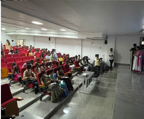
Photos at the time of event