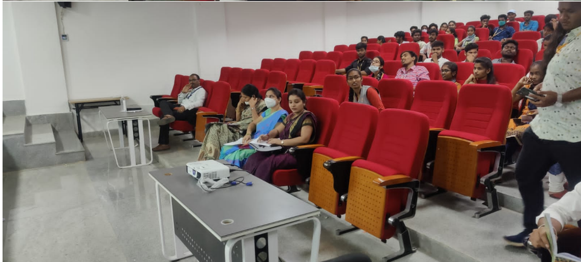
Photos of the Jury panel